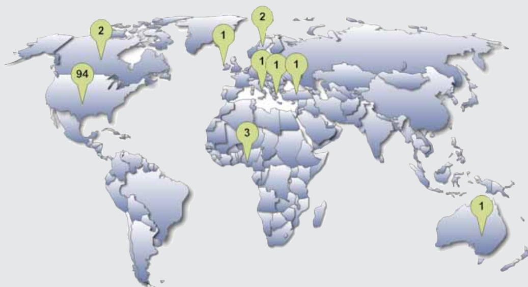
The ATS Foundation has provided grant support to investigators throughout the world to combat the universal burden of lung disease. Markers reflect number of grants awarded by country between 2002–2011.

Today, the Foundation’s ultimate goal is to eliminate the many lung, critical care, and sleep-related illnesses that shorten or diminish lives. The pages that follow highlight how the ATS Foundation Research Program is uniquely situated to make enormous progress in reversing these disease trends. To succeed in our efforts, we must have a strong research enterprise—here in the United States and around the world—and your support.